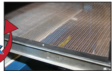
mesh in low position for thicker garments (sweats & hoodies)