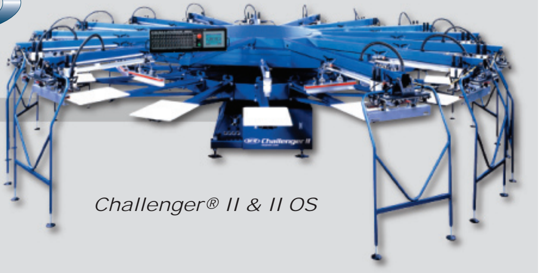
Challenger® II & II OS